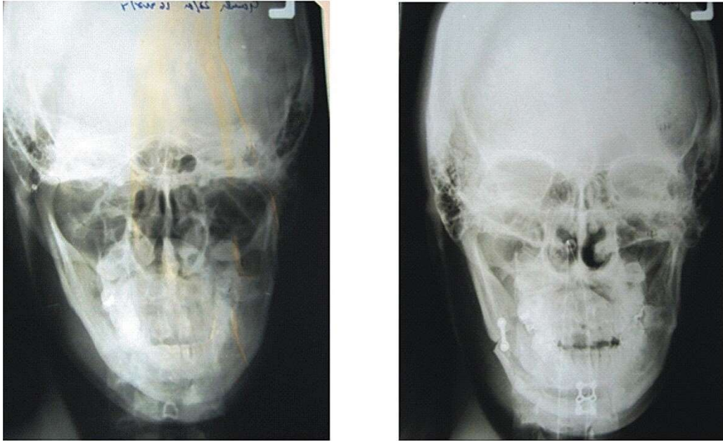
Figure 8. The image displays a PA Cephalogram depicting the radiographic changes that occurred before and after orthomorphologic surgery.